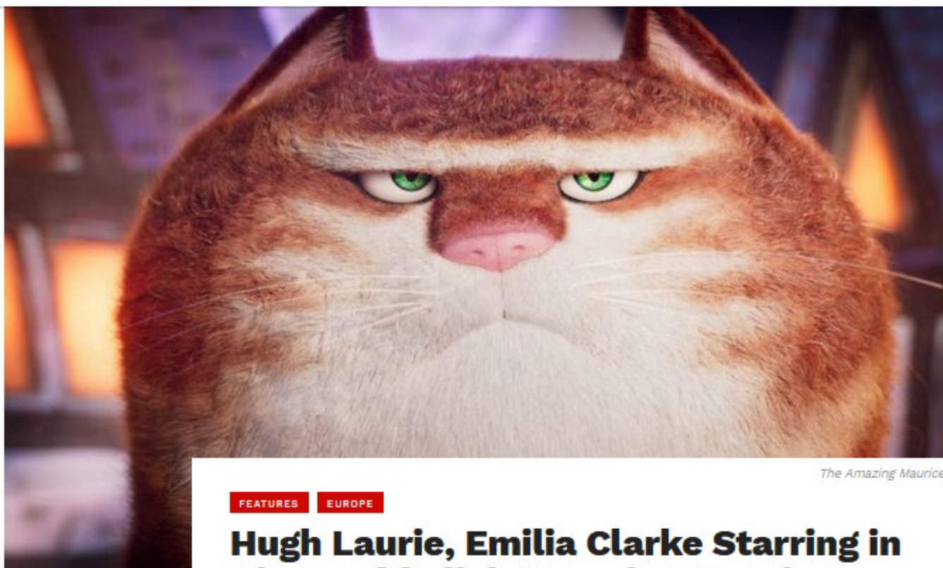
The Amazing Maurice