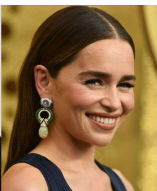
Hugh Laurie and Emilia Clarke